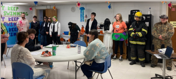
Halloween Costume Contest