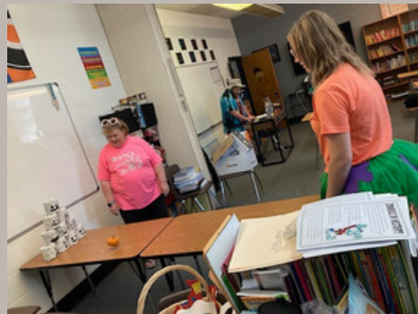
Ghost Pumpkin Bowling