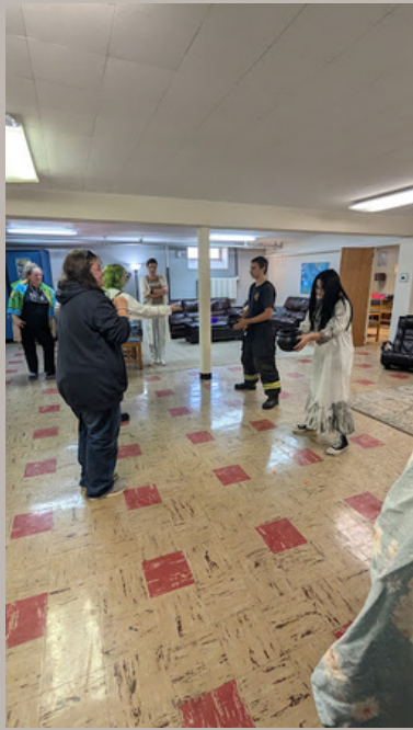
Candy corn toss

During the last week of October, we celebrated SPIRIT WEEK! We chose a different theme for each day of the week. See the flyer below, which was made by one of our students. We had a lot of fun activities throughout the week and enjoyed a SPIRIT day on Halloween. We enjoyed lunch together and played different Halloween-themed games. It was a great way to end the month and first quarter.