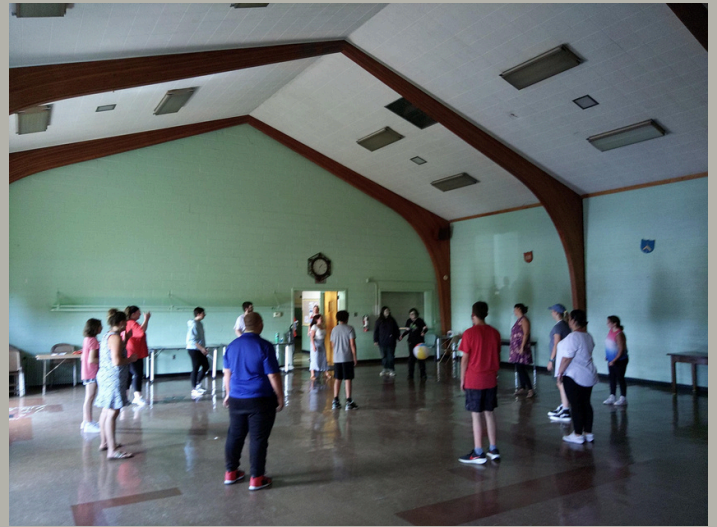
A favorite game - keep the ball in the air!